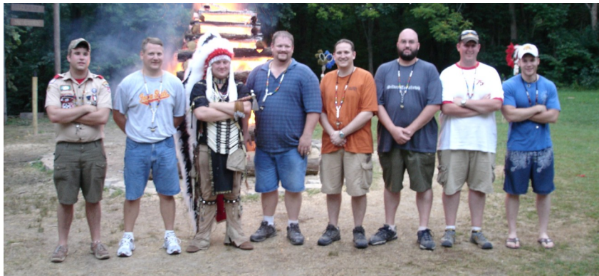
Eight Past Chiefs come together before the roaring fire.