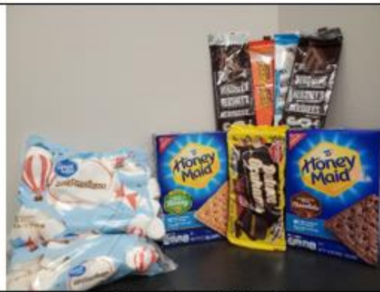
S'mores Campsite Bundle

$19 Delivered to your campsite $22 Ice cold in a cooler when you arrive