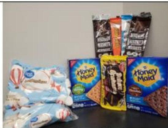
S'mores Campsite Bundle

$19 Delivered to your campsite $22 Ice cold in a cooler when you arrive