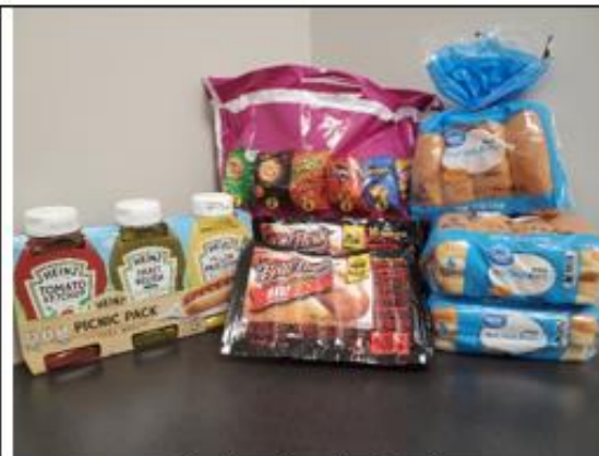
Hot Dog Campsite Bundle

$25 This sweet bundle can be delivered to your Scout's Campsite on the night of your choosing. Contains both honey & chocolate graham crackers, marshmallows, fudge dipped graham crackers, Hershey's chocolate, Reese's peanut butter cups, and one other surprise chocolate flavor (cookies and cream pictured). Serves 25.